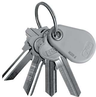
PKT-10X Proximity Key Ring Tag