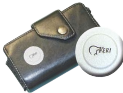
AP-10X Adhesive Proximity Patch