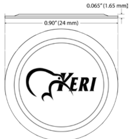
AP-10X Adhesive Proximity Patch

Specifications subject to change without notice.