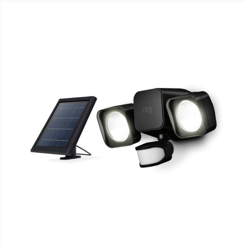
Ring Smart Lighting Solar Floodlight

Ring Smart Lighting Solar devices are motion-activated and, with a Ring Bridge, they allow users to receive motion notifications, turn their lights on and off remotely, adjust the brightness and motion sensitivity, and set schedules, all right from the Ring App.