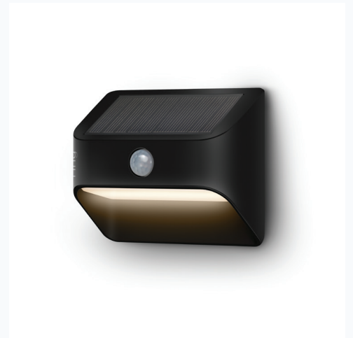
Ring Smart Lighting Solar Steplight

*Ring Bridge required for smart controls and use in the Ring App.