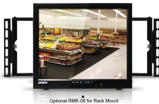
Optional RMK-08 for Rack Mount